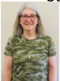
The Quilt Peddler Johnstown, PA