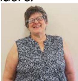
Angel Dreams Kersey, PA